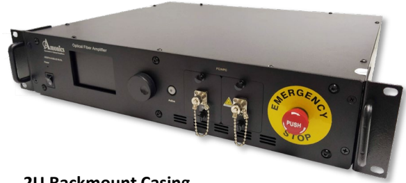
2U Rackmount Casing