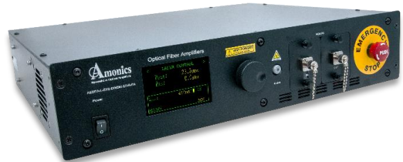
2U Rackmount Casing